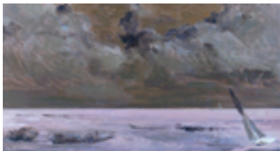
James Abbott McNeill Whistler (1834–1903), The Sea , ca. 1865, oil on canvas.